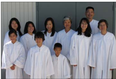
Some of the October baptism candidates

Today, I am getting baptized to be obedient and pleasing to God. I want to thank the Lord for my family and friends for witnessing my blessing of baptism.